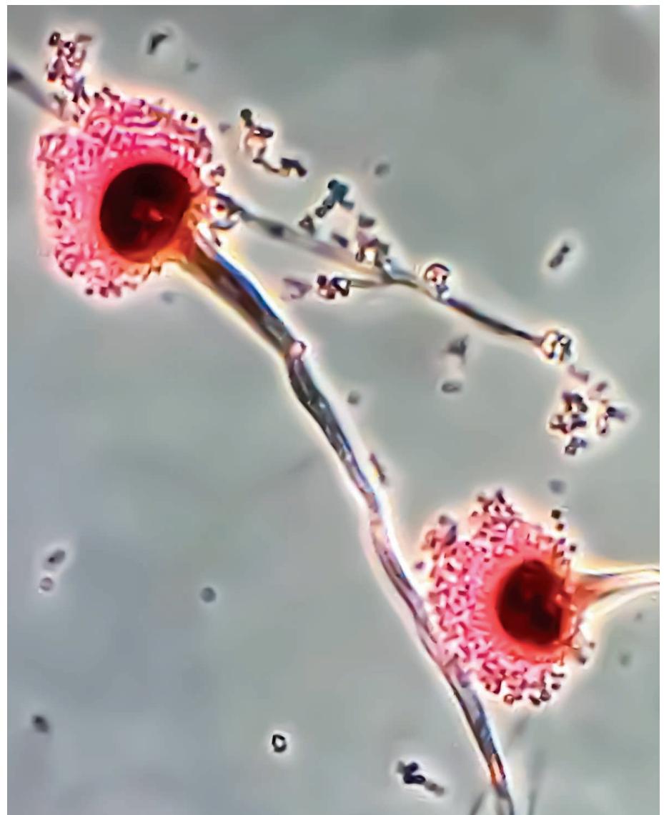
Photomicrograph of Aspergillus fumigatus . This fungus causes life-threatening invasive and chronic aspergillosis as well as driving severe asthma. Although drug treatments exist, mortality remains high.