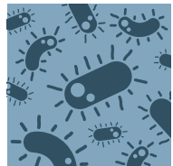
INFECTIOUS DISEASE SERIES

About 1.2 billion people worldwide are estimated to suffer from a fungal disease (1, 2). Most are infections of the skin or mucosa, which respond readily to therapy, but a substantial minority is invasive or chronic and difficult to diagnose and treat. An estimated 1.5 to 2 million people die of a fungal infection each year, surpassing those killed by either malaria or tuberculosis (3). Most of this mortality is caused by species belonging to four genera of fungi: Aspergillus , Candida , Cryptococcus , and Pneumocystis . Although great strides were made in the 1990s, drug development has largely stalled since then.